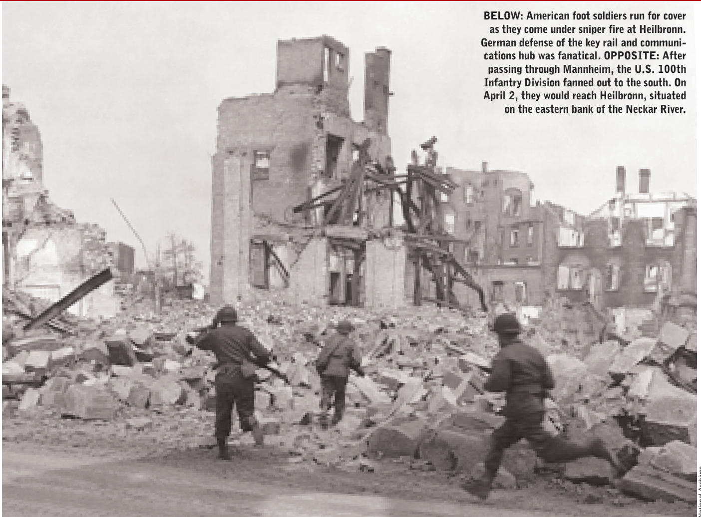
BELOW: American foot soldiers run for cover as they come under sniper fire at Heilbronn. German defense of the key rail and communications hub was fanatical. OPPOSITE: After passing through Mannheim, the U.S. 100th Infantry Division fanned out to the south. On April 2, they would reach Heilbronn, situated on the eastern bank of the Neckar River.