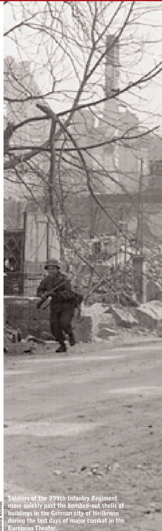
Soldiers of the 399th Infantry Regiment move quickly past the bombed-out shells of buildings in the German city of Heilbronn during the last days of major combat in the European Theater.