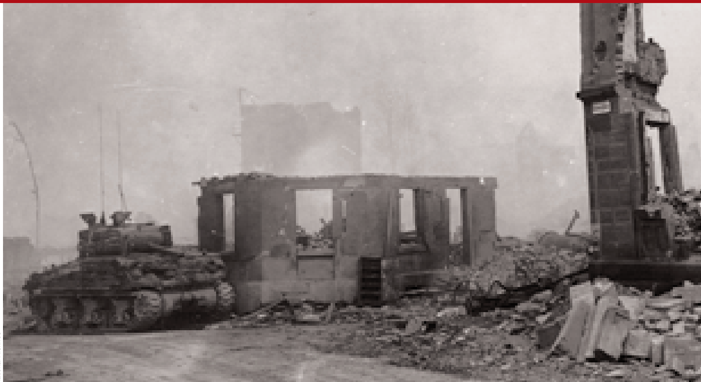
ABOVE: A U.S. tank, disabled during the fighting, sits among the rubble of Heilbronn. OPPOSITE: An American soldier looks out over Heilbronn from an observation post.

long factory, with all but half of its first floor blown away. In the center of the orchard, a German machine gun was emplaced in a dugout where the trees were sparse enough to afford good lanes of fire.