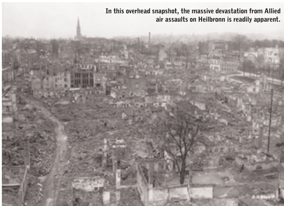
In this overhead snapshot, the massive devastation from Allied air assaults on Heilbronn is readily apparent.

Meanwhile, a large German force attacked