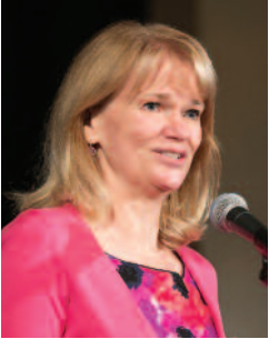
Martha Raddatz served as master of ceremonies