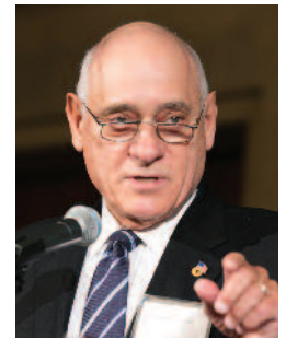
Gen. Carl Vuono, USA (Ret.)

For more information and to watch a video or look at photos from the event, go to our web site at www.marshallfoundation.org .