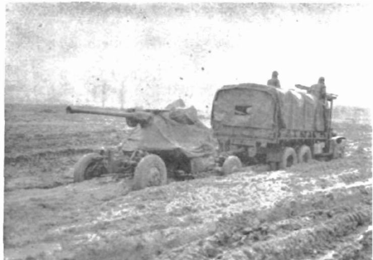
We took losses, too. Above, an American tank knocked out on the outskirts of Lemberg. Right, one of our big guns is jockeyed into position in a field south of the town.

Mouterhouse road. The enemy was firing from positions on Hill 345 in a curve of the road and from pillboxes, fixed armored vehicles, and buildings at the base of the hill. If the company advanced, it would have to move up hill into an arc where the enemy had fire from three sides.