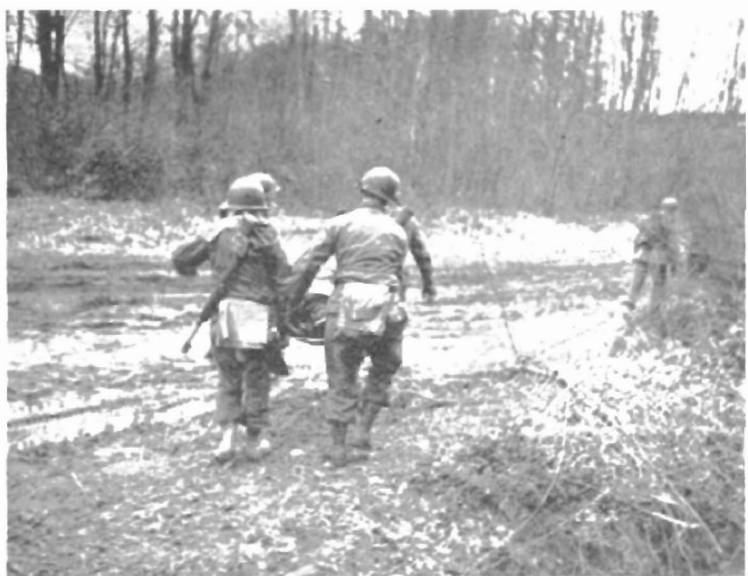
A wounded Centuryman is carried to the rear by four of his buddies. Left, cover was sparse in some sectors and positions had to be taken in the open.

in St. Louis before midnight of 9 December. During 10 December, while the 2nd Battalion consolidated its positions on the Hochfirst to the northeast, the 3rd Battalion reorganized in the northeast sector of Lemberg under light artillery fire throughout the day. A platoon was sent to outpost le Schlossberg, the hill to north of town. In late afternoon the 398th began to relieve the 399th which went into division reserve.