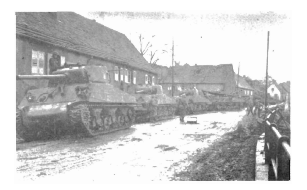
Tanks and TDs line up along the main street of Lemberg preparatory to moving forward in the drive against Bitche.

supported by infantry armed with automatic weapons. Having the advantage of terrain and fire-power, the Krauts forced the 1st Platoon into their foxholes and then overran the positions, firing into them at point-blank range. The 2nd Platoon, unable to come to their comrades rescue, with their own right flank exposed, circled back to the south side of the railroad and joined the rest of the company in regrouping.