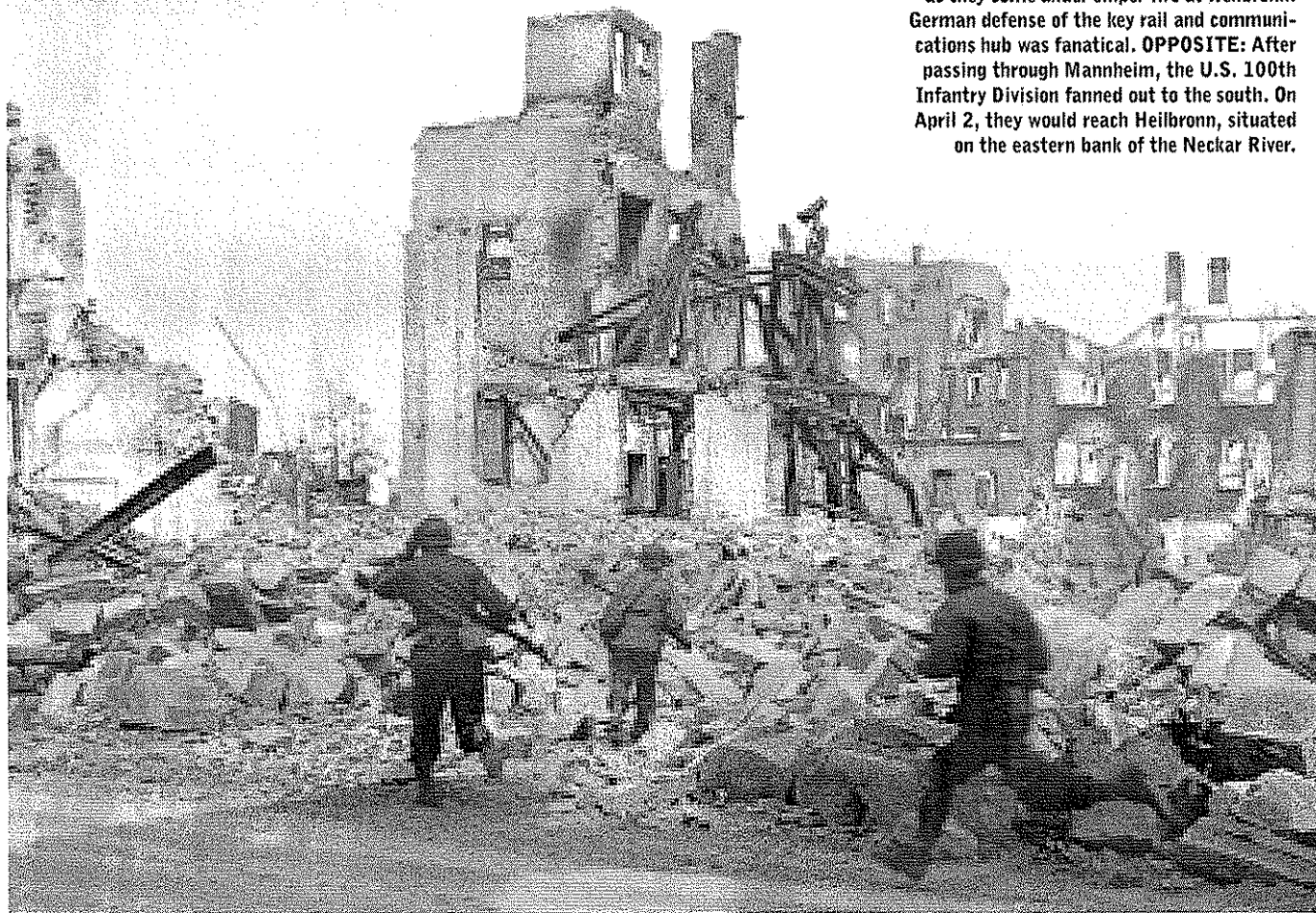
BELOW: American foot soldiers run for cover as they come under sniper fire at Heilbronn. German defense of the key rail and communications hub was fanatical. OPPOSITE: After passing through Mannheim, the U.S. 100th Infantry Division fanned out to the south. On April 2, they would reach Heilbronn, situated on the eastern bank of the Neckar River.

fered two more counterattacks, one at noon and another shortly afterwards, but beat them back. The two companies then moved out to attack. Company C captured the Knorr works for the second time with little difficulty, and Company B, also facing negligible opposition, reestablished positions on the Flein road that it had been forced to abandon earlier.