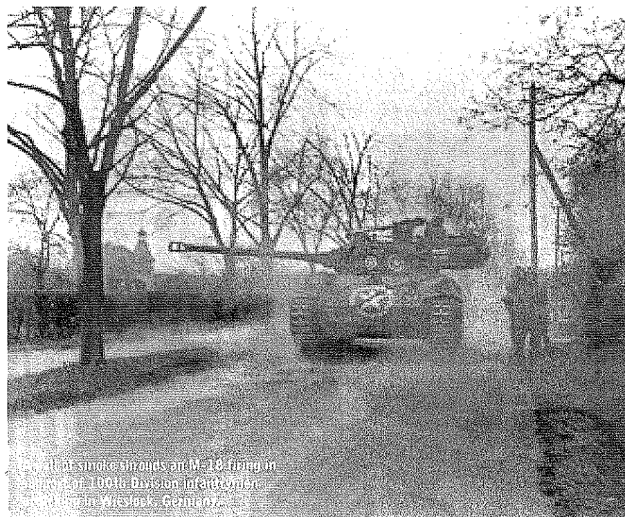
A cloud of smoke shrouds an M-18 firing in support of 100th Division infantrymen during the Battle of Heilbronn, Germany.

The company withdrew to a line along the northern edge of the sugar refinery. The two Tigers came after them, but as they moved into