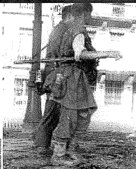
During their retreat from Lyon, a pair of German soldiers walk down a desolate city street.