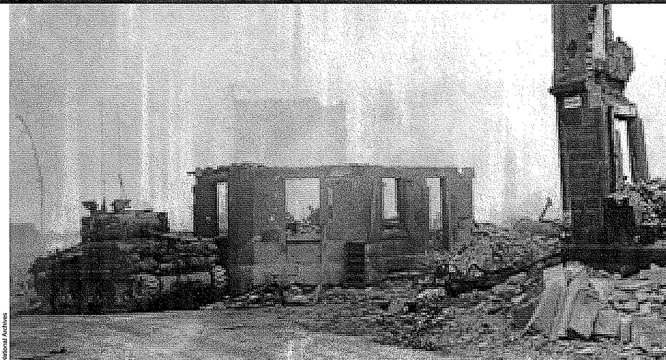
ABOVE: A U.S. tank, disabled during the fighting, sits among the rubble of Heilbronn. OPPOSITE: An American soldier looks out over Heilbronn from an observation post.

long factory, with all but half of its first floor blown away. In the center of the orchard, a German machine gun was emplaced in a dugout where the trees were sparse enough to afford good lanes of fire.