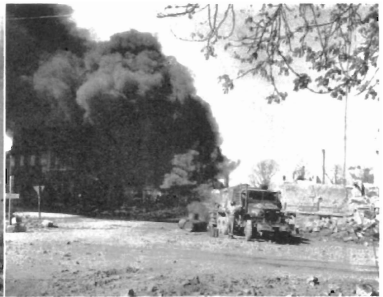
Dense smoke screen covers movements of our troops from observation.

Although the German artillery still commanded the city and both banks of the Neckar, the artillery of the 100th and attached units effectively offset this advan-