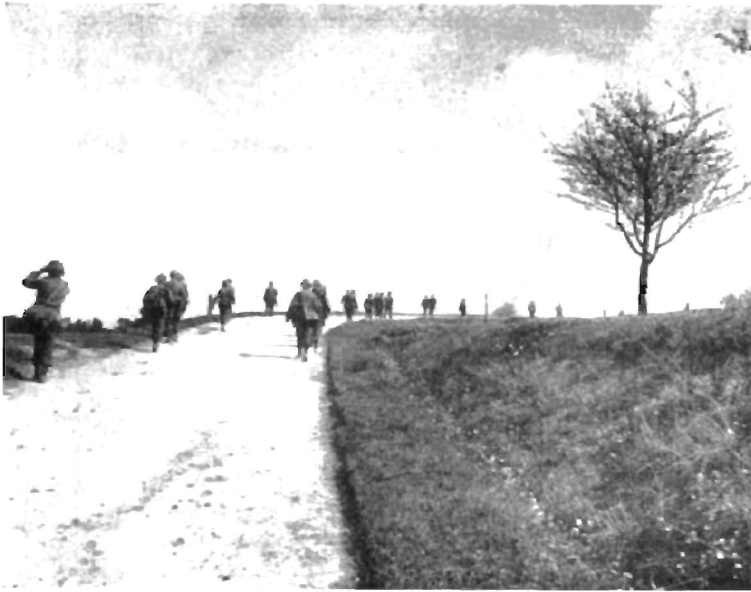
Above, doughfeet trudge deeper into Germany toward Heilbronn. Right, a column of Centurymen slashes through a segment of the vaunted Ziegfried Line.