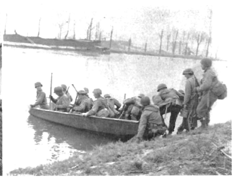
Loading into an assault boat for the hazardous Neckar crossing.

the Centurymen turned their attention to two shell-pocked houses off to the right and slightly behind the first factory building. Unable to approach the nearest house directly because of intense enemy fire, the 3rd Platoon of Co. E crawled along a catwalk to the rear of the house. From there, with the help of men of the 1st Platoon who had remained behind the concrete wall, they cleared the structure.