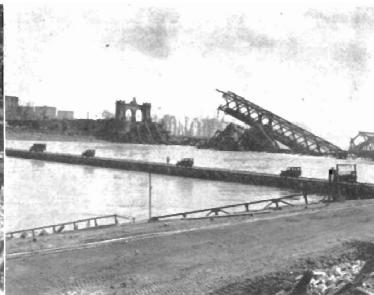
Left, an aerial view of Mannheim showing complete devastation. Above, wrecked Rhine bridge connecting Mannheim with Ludwigshafen. Army ponton span is in the foreground.

skirts of Gemmingen the Germans made a stand on the rough, hilly ground east of the little village. With the Krauts in command of all the roads leading to towns along the route, as well as the large woods to the south, heavy mortar and artillery fire began dropping among the 1st Battalion troops.