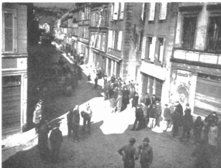
The citizens of Bitche crowded the streets to welcome the Yanks.

hospitals and the civilian doctors in the care of the sick and wounded. After five long years Bitche had become French again.