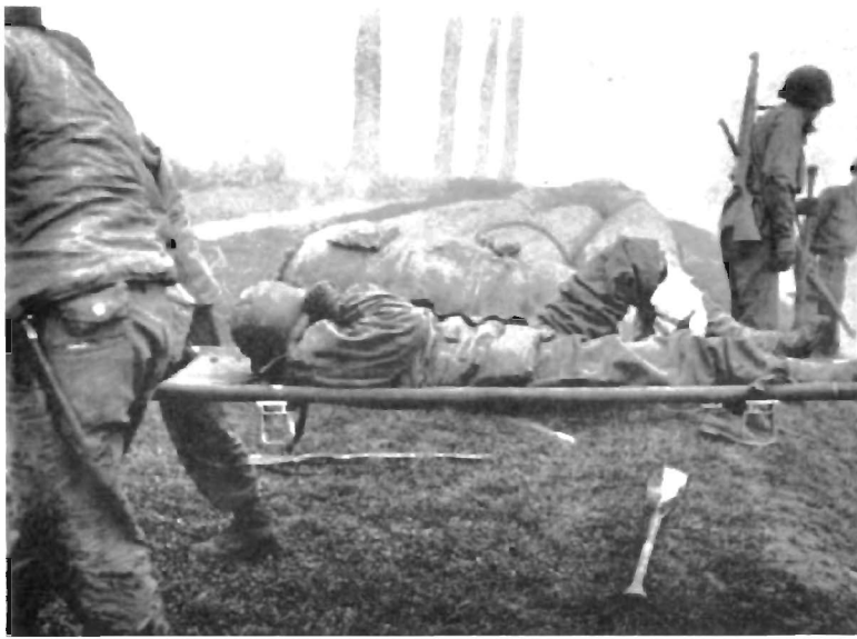
A wounded infantryman is carried from the bridgehead battleground.