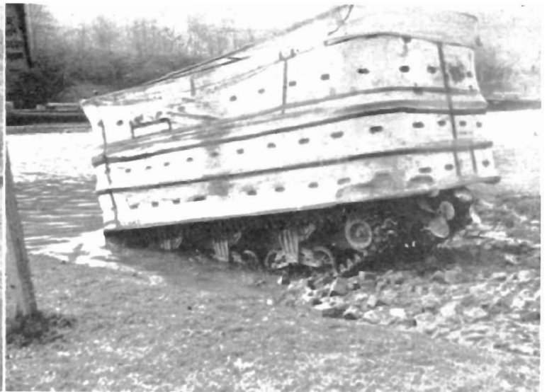
Even amphibious tanks were utilized to keep vital supplies floating across the Neckar to the hard-pressed bridgehead.

two neighboring houses from which Co. E had been forced to retreat the night before.