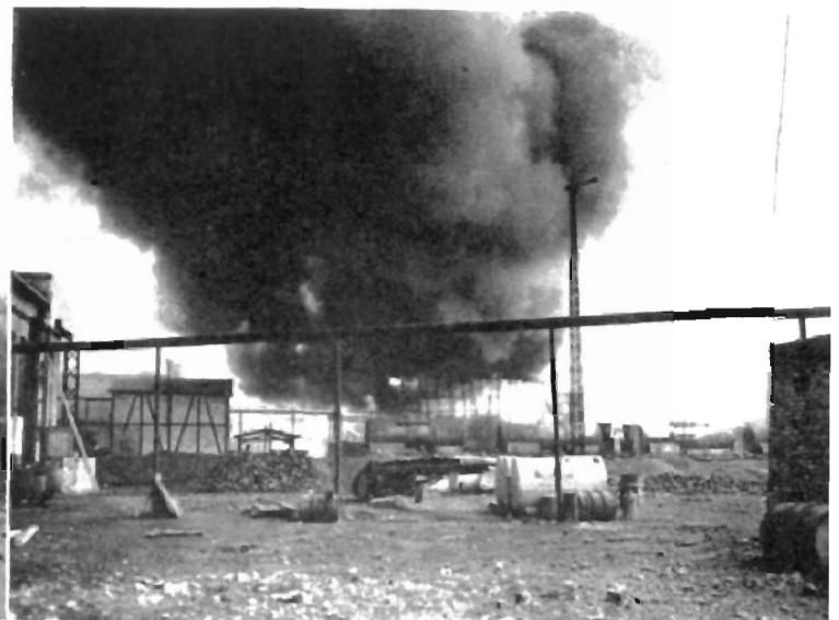
The Jerries fire Heilbronn oil reserves in the path of our advance.