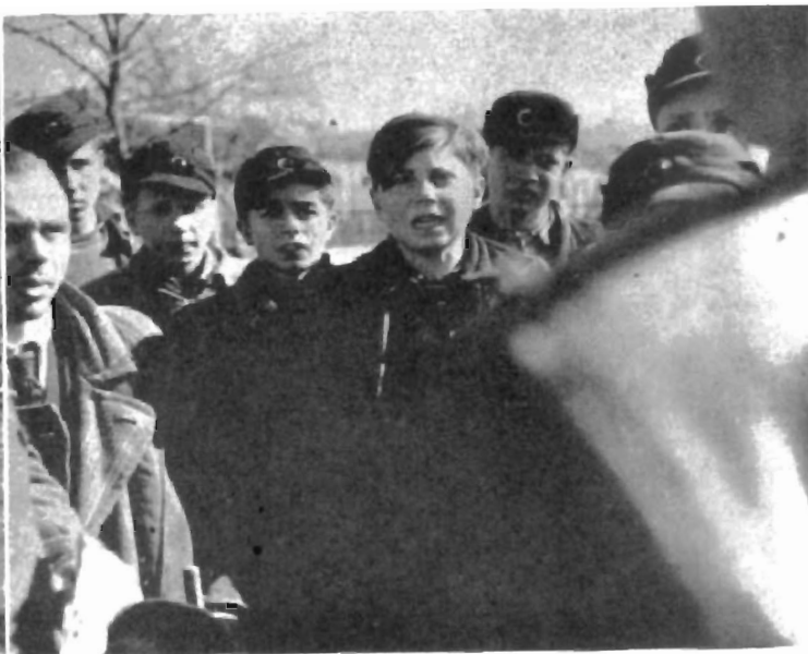
Hitler "Jugend," too young to shave, captured at Heilbronn.

George Co. waited in this position until Cos. I and L of the 397th, now actively engaged, caught up with them, after which the attack continued. Co. F mopped up the few remaining buildings in the glassworks and advanced to a small grove of trees at the southern tip of the glassworks area. Co. I, on the left of Co. F, pushed to the Fiat automobile factory along the road