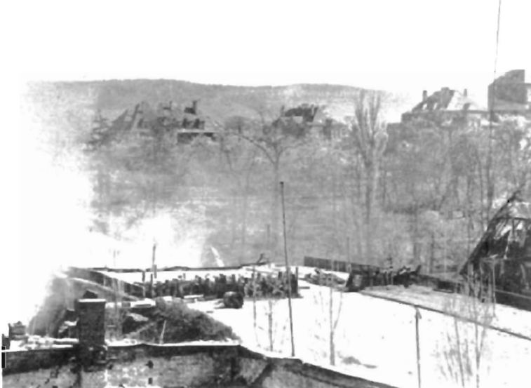
One of the sturdy steel and concrete bridges across the Neckar which was destroyed by the enemy. Demolition was efficient.

After dark on 4 April, Co. A of the 31st Engrs. again attempted to complete a treadway bridge or raft capable of carrying tanks and TDs to the east bank of the Neckar. Enemy artillery concentrations upon the bridge site were so accurate even in the darkness that the project was once more abandoned. Inspired by the necessity for getting armor across the river to the hard-pressed Centurymen, the 31st Engrs. grimly continued their efforts although silhouetted by fires caused by enemy artillery in Neckargartach and the factory district on the east bank of the river. Fourteen engineers were hit by shell-fire during the first hour of work. Each attempt to launch ponton floats was met with an uncannily accurate artillery concentration which punctured the floats and caused several additional casualties among the engineers. The site of the bridge