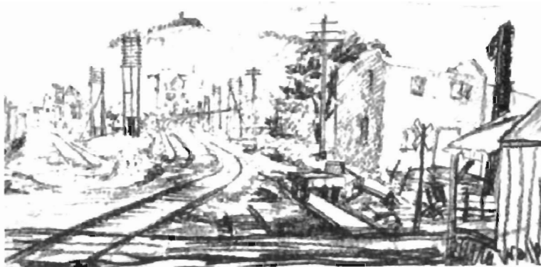
Crayon sketch of railroad spur passing through Heilbronn factory district. Right, summit of Tower Hill.