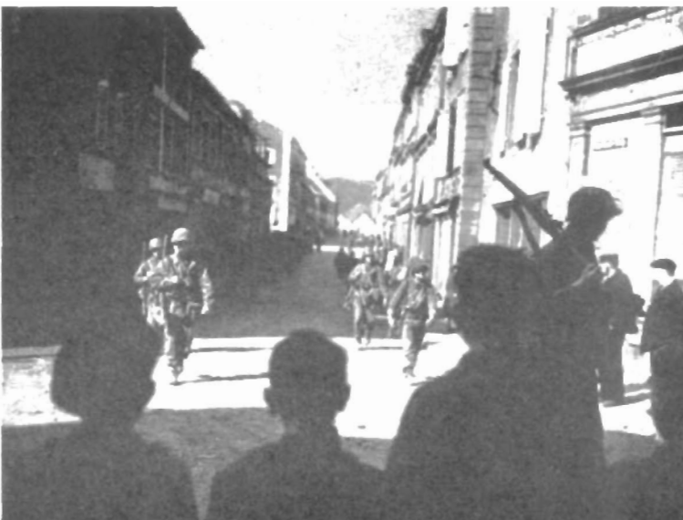
We acknowledged the cheers of the Frenchmen and pressed on.

Co. K of the 399th crossed the border into Germany at 1431 on 17 March on the road between Liederschiedt and Schweix. With the area around the Camp de Bitche taken over by the 398th Inf., the 1st Battalion of the 399th also attacked north. The battalion moved by truck to Haspelschiedt to the northeast and then took Neudoerfel and Roppeviller. Cos. A and B