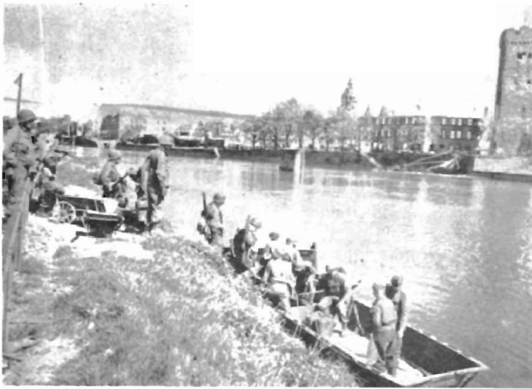
With the enemy knocking out bridges as soon as we put them in, supplies had to be ferried across by boat or any other means.