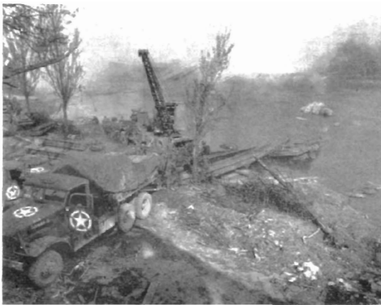
The engineers attempt to salvage the remains of a ponton bridge.

oners and casualties were evacuated. But the vital tanks and TD's still could not join the fight.