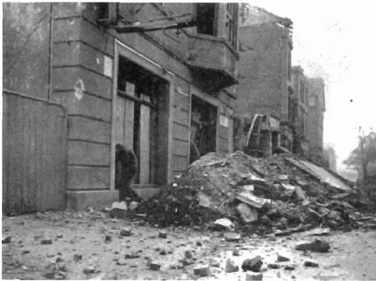
Centurymen rush for available cover as enemy artillery "comes in".