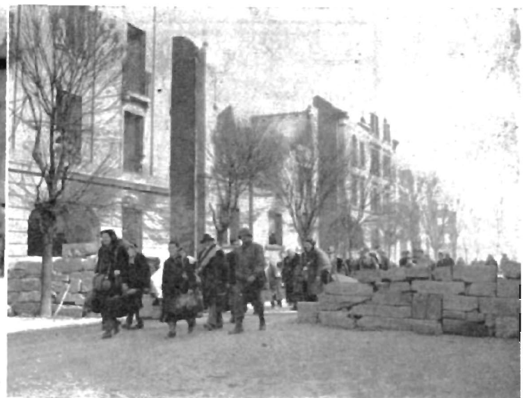
Above, allied PWs of several nationalities pound the long road back to home and loved ones following liberation. Right, German civilians return to their battered "castles".

were a group of easily defended hills, bare almost to their summits, with thick woods at the crests which afforded excellent concealment for German artillery and gave the enemy unbroken observation of every inch of the river from Neckarsulm, on the north, to Sontheim on the south.