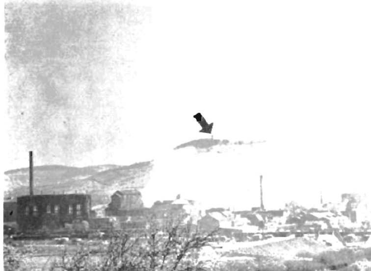
Site of our initial Neckar bridgehead. Arrow points to tower on Tower Hill. The troublesome glassworks is in the left foreground.

filled ditch, the 3rd Battalion was engaged in driving off repeated fierce assaults against their positions. Several of these enemy counterattacks were led by tanks. But with the support of two TDs and two tanks which fired at the Germans from the left bank of the Neckar, the 3rd Battalion beat off every enemy effort to drive them from their positions.