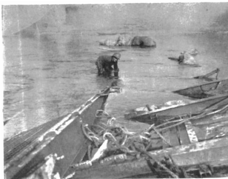
An engineer probes for wreckage of short-lived treadway bridge.

firing, however, was concentrated on buildings in the city, just ahead of the infantrymen, and on enemy tanks, supply columns and troop assembly points ferreted out by our air observers.