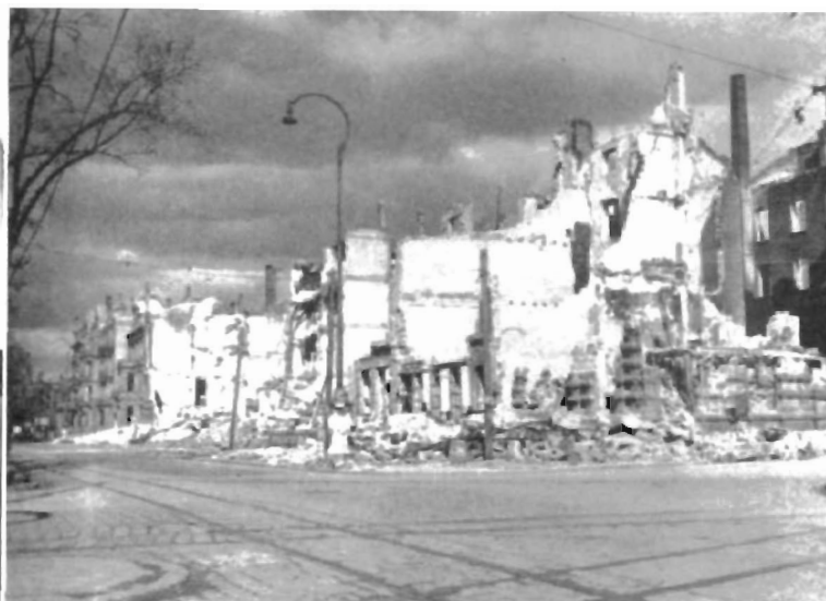
The industrial city of Mannheim on the east bank of the Rhine had been badly battered by constant air bombardment.

Eichtersheim, an advance of about 16 kilometers, against minor enemy opposition such as roadblocks, mines, and sniper fire. The 2nd Battalion, crossing the line of departure at the same time, cleared Horrenberg, Hoffenheim, and Sinsheim, after a 30-minute artillery preparation. Some opposition was encountered along the roads in this sector in the form of light artillery fire and sniper action. The 3rd Battalion, in reserve, followed the lead of the 1st and 2nd Battalions. The extraordinary number of 1,080 prisoners were taken during the day's action by the regiment; almost as many as in the previous six months of combat.