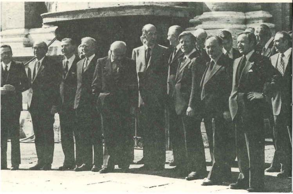
The European Community Information Service, Washington, D.C.

Two sequels to the Marshall Plan: NATO's North Atlantic Council (above) and heads of government of the European Common Market (below)