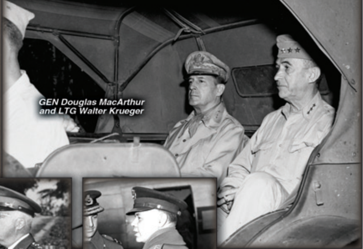
GEN Douglas MacArthur and LTG Walter Krueger