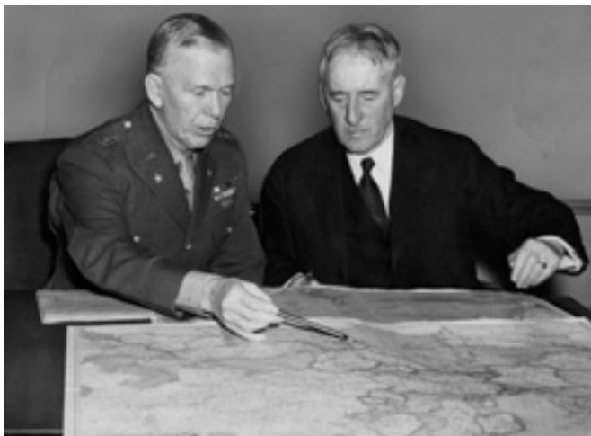
GEN Marshall with Secretary of War Henry L. Stimson.

Not surprisingly, those officers who vigorously advocated their personal advancement had no place in Marshall’s Army. Take the case of LTG Hugh Drum, who had been one of Marshall’s principal rivals for the position of Chief of Staff. Initially advanced by Stimson to head the “China Mission,” Drum made it known that he preferred not to languish in the backwater of the war in a far-off theater. Tempers flared when Drum made his preferences known to Marshall, who told Drum in no uncertain