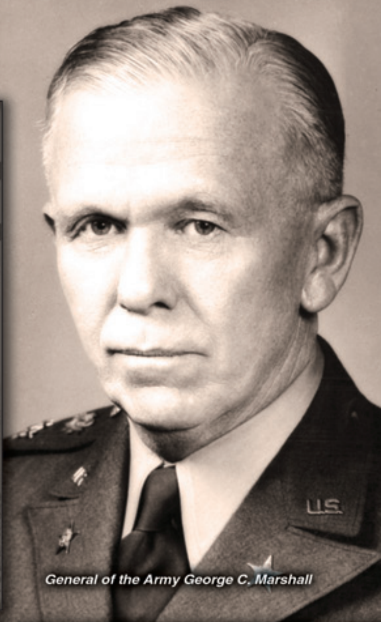
General of the Army George C. Marshall