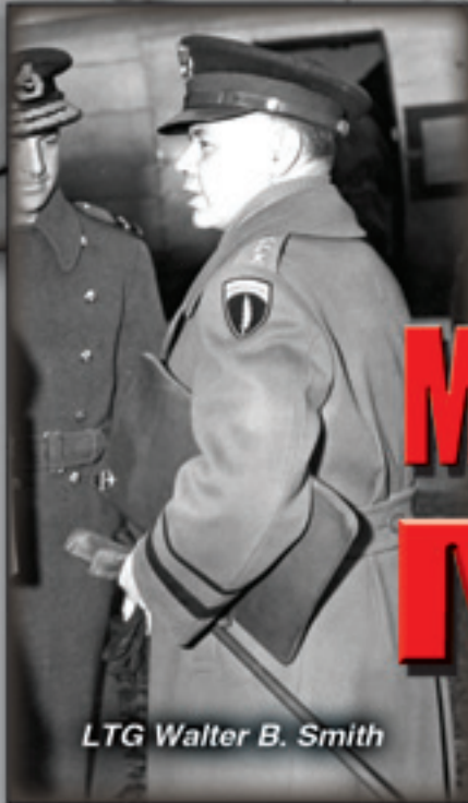
LTG Walter B. Smith