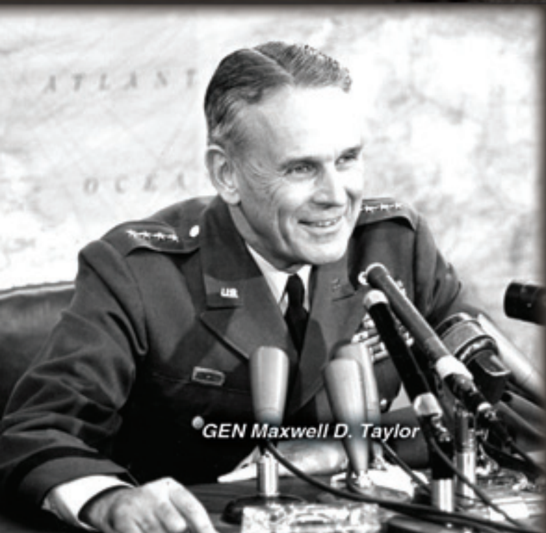
GEN Maxwell D. Taylor