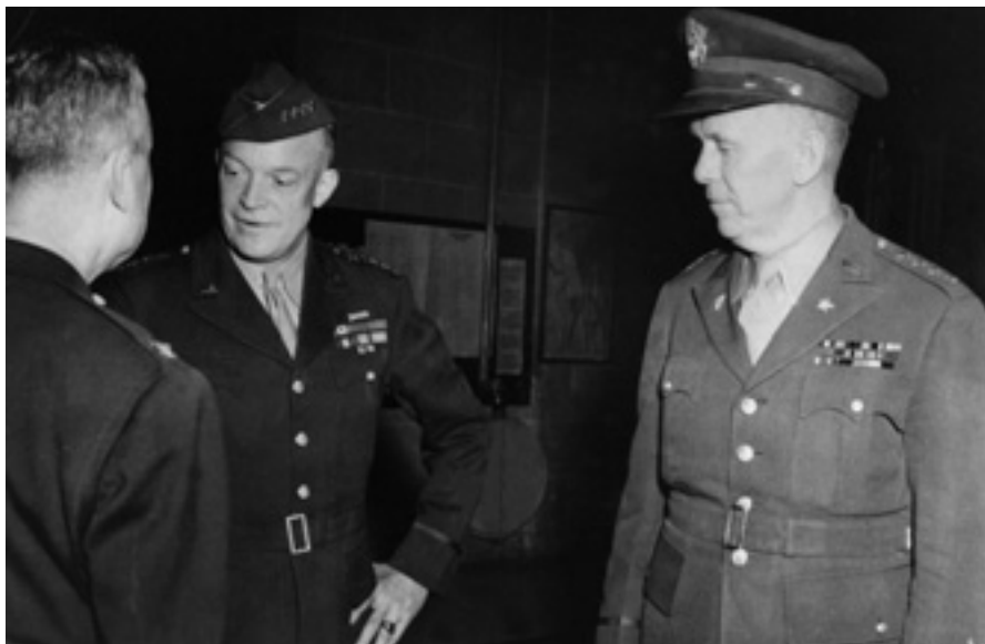
GEN Krueger, left, and, above, GEN Eisenhower and GEN Marshall.

drew the line, informing Ike that the Mediterranean Theater required seasoned commanders as well. He gave Eisenhower most, but not all, of the officers he had requested.