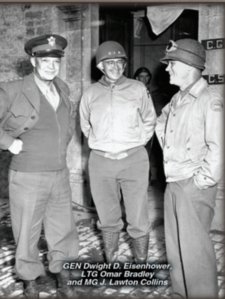
GEN Dwight D. Eisenhower, LTG Omar Bradley and MG J. Lawton Collins