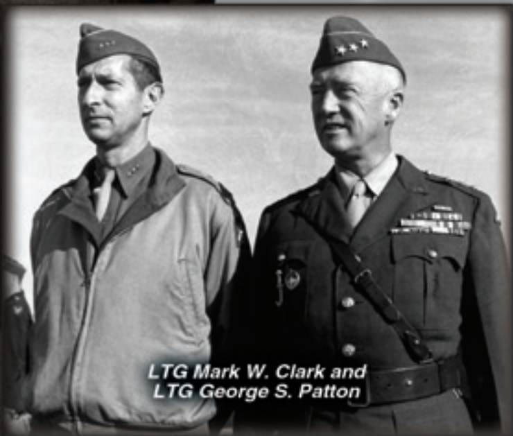
LTG Mark W. Clark and LTG George S. Patton