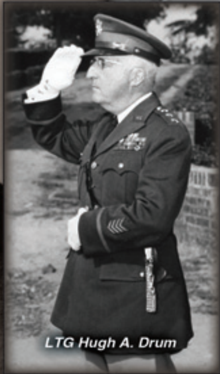
LTG Hugh A. Drum