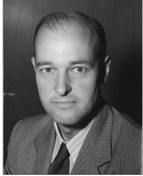
Above left: William D. Clayton, Under Secretary of State for Economic Affairs, 1946–47. Above right: George F. Kennan, Soviet expert and head of the State Department's Policy Planning Staff, 1947–49.