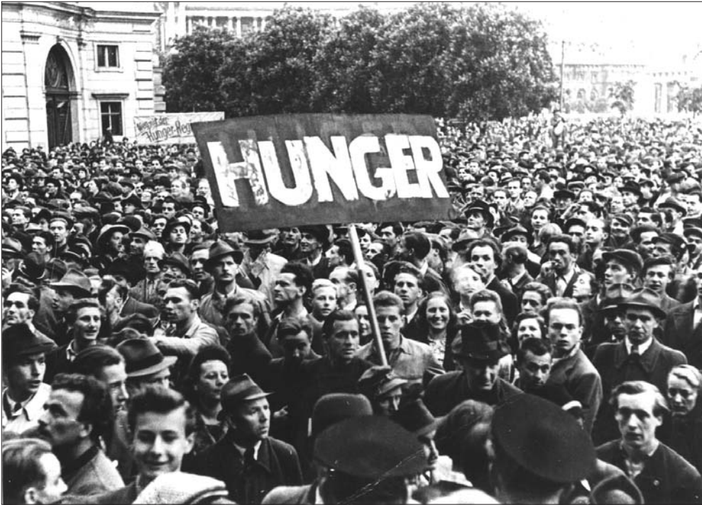
Vienna food protest, May 14, 1947.

general postwar upswing that stalled, Germany suffered greatly as GDP plummeted 70% between 1945 and 1947.