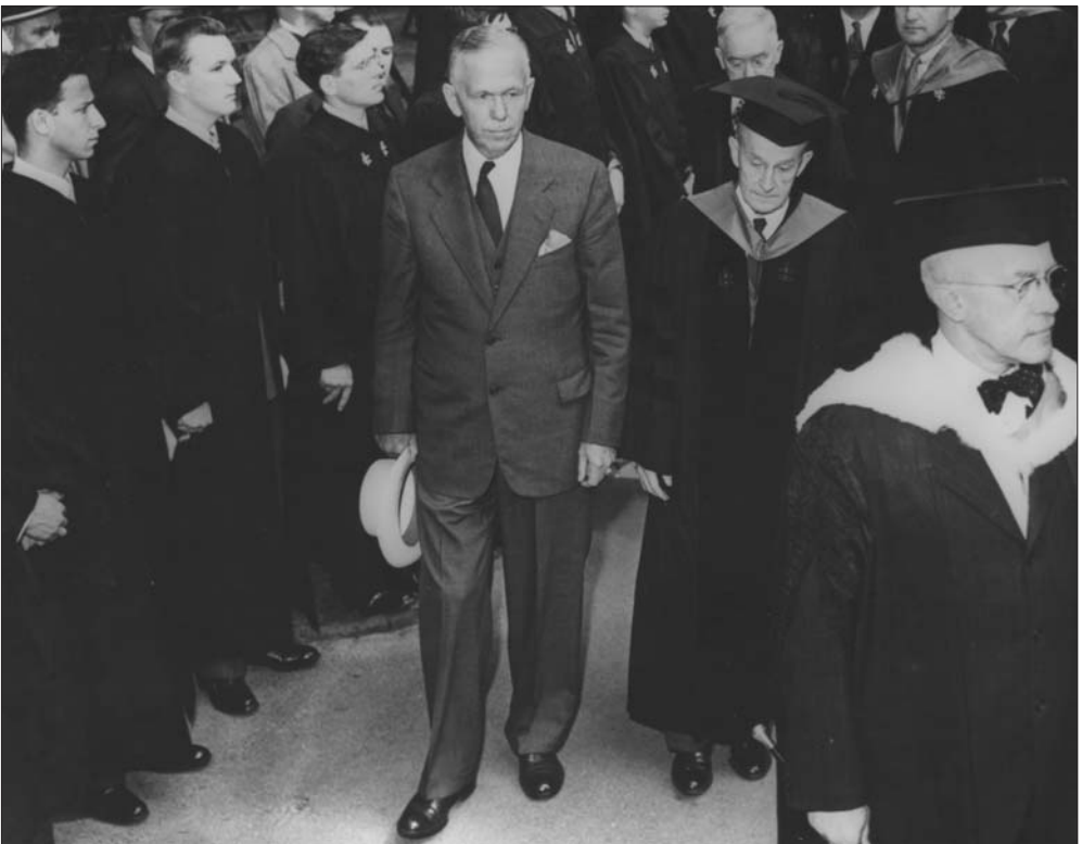
Below: Secretary of State George C. Marshall walks to the Harvard University postgraduation Alumni Ceremony to receive an honorary degree and to deliver a short speech, June 5, 1947.