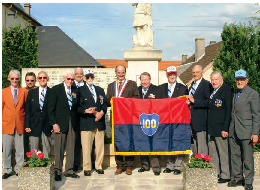
Centurymen return to Rimling, 2005.