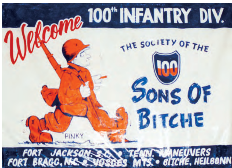
Association banner welcomes Centurymen to the convention