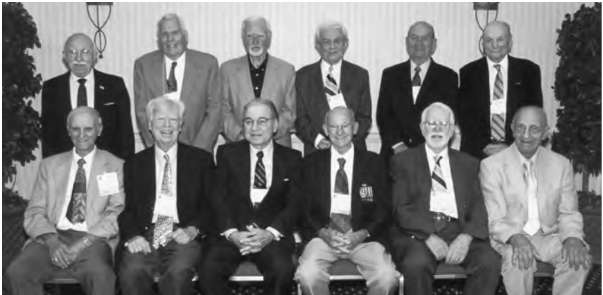
Newton, MA, 2004. After almost 60 years of reunions, who would have thought that we still would get 12 first timers to the convention?!

Meetings of the Association followed a pattern that changed somewhat over the years, but still held to their essential purpose: facilitating the annual coming together of men who had gone through hell together and formed a bond that could not break. That was the basic premise, and even now “drinking beer with my buddies” (for those who still could) was an