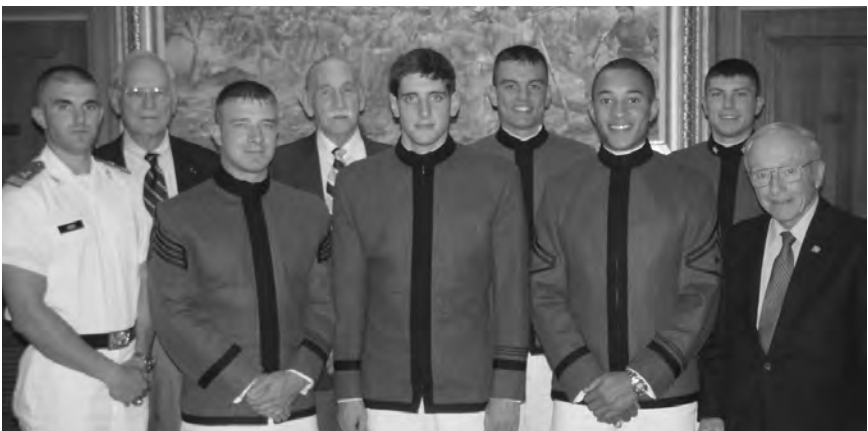
100th Division Association representatives meet with the VMI cadets who received the award, May 2005.

On May 5, 2000 the VMI Foundation provided additional information to the Association: its Articles of Incorporation and Bylaws of the Foundation; the FY 1999 Annual Report; and a current VMI admissions catalog.