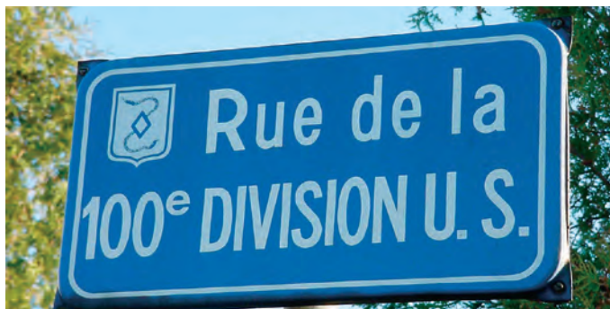
St. Avold Cemetery (above)