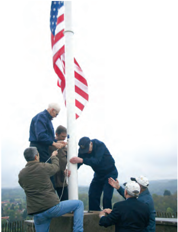
Centurymen raise the American flag over Fort Simserhof, May 2010.