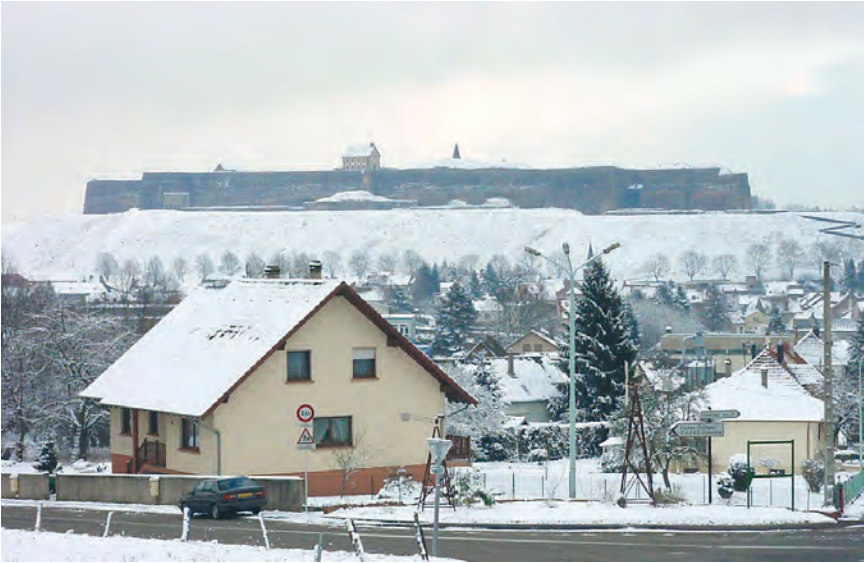
Citadel at Bitche, 2007.