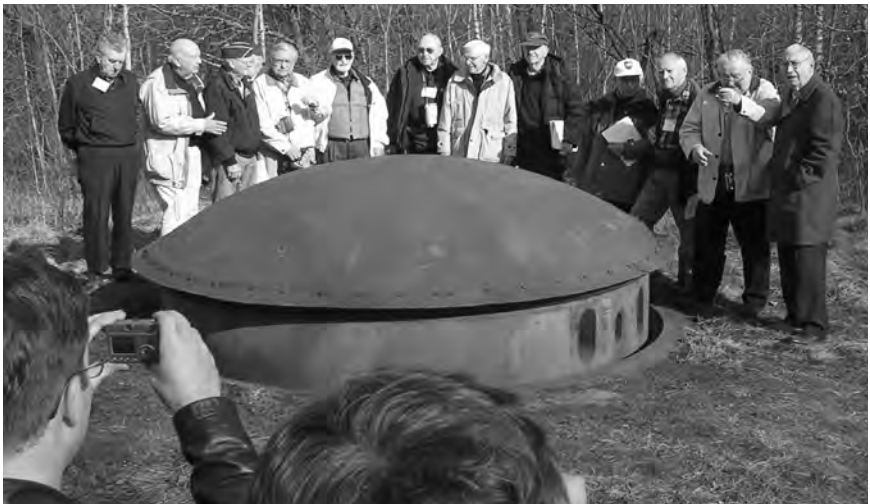
Centurymen tour Maginot pillbox, 2005.

The 2008 and 2010 tours were enhanced by the presence of French WW II US military reenactors. Clad in their 100th Division uniform replicas, they gave tour participants rides in restored US military vehicles from the period, otherwise enlivening the ceremonies.